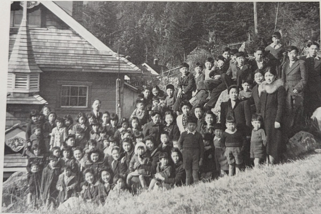
Ocean Falls Sunday School January, 1942

During this centennial one thing we can do is to celebrate and give thanks to God for ministers, missionaries, teachers and our pioneer lay leaders. Although many of the saints are no longer with us, we pay tribute to them for their dedication and friendship.