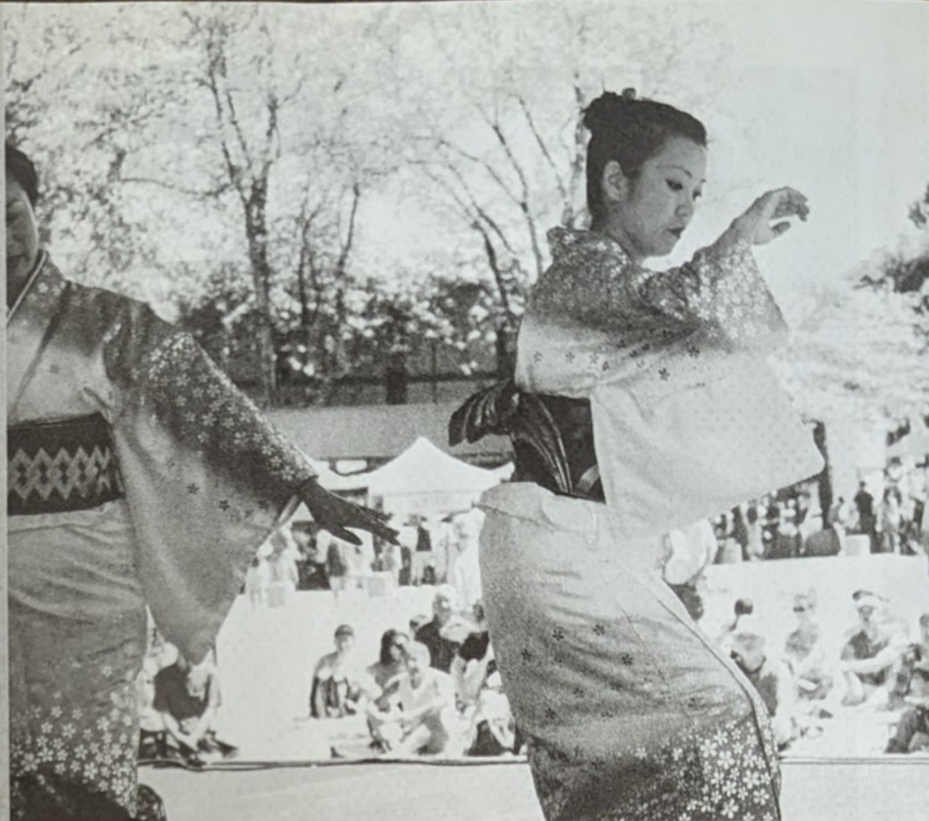
Powell Street Festival.