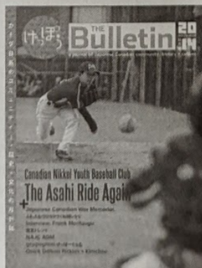
Vancouver Asahi tribute game

Submission Deadline December 2014 issue November 15, 2014