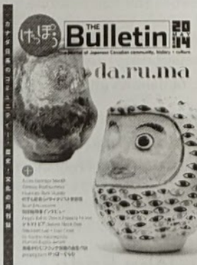
Darumas.

Submission Deadline June 2014 issue May 18, 2014