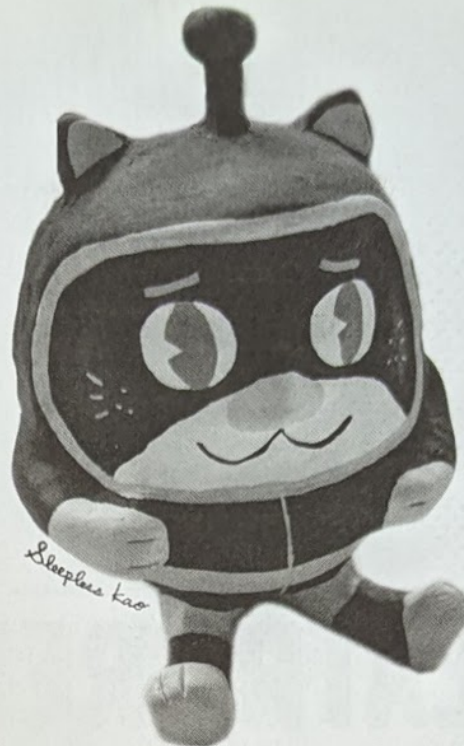
Astro Cat daruma by Sleepless Kao